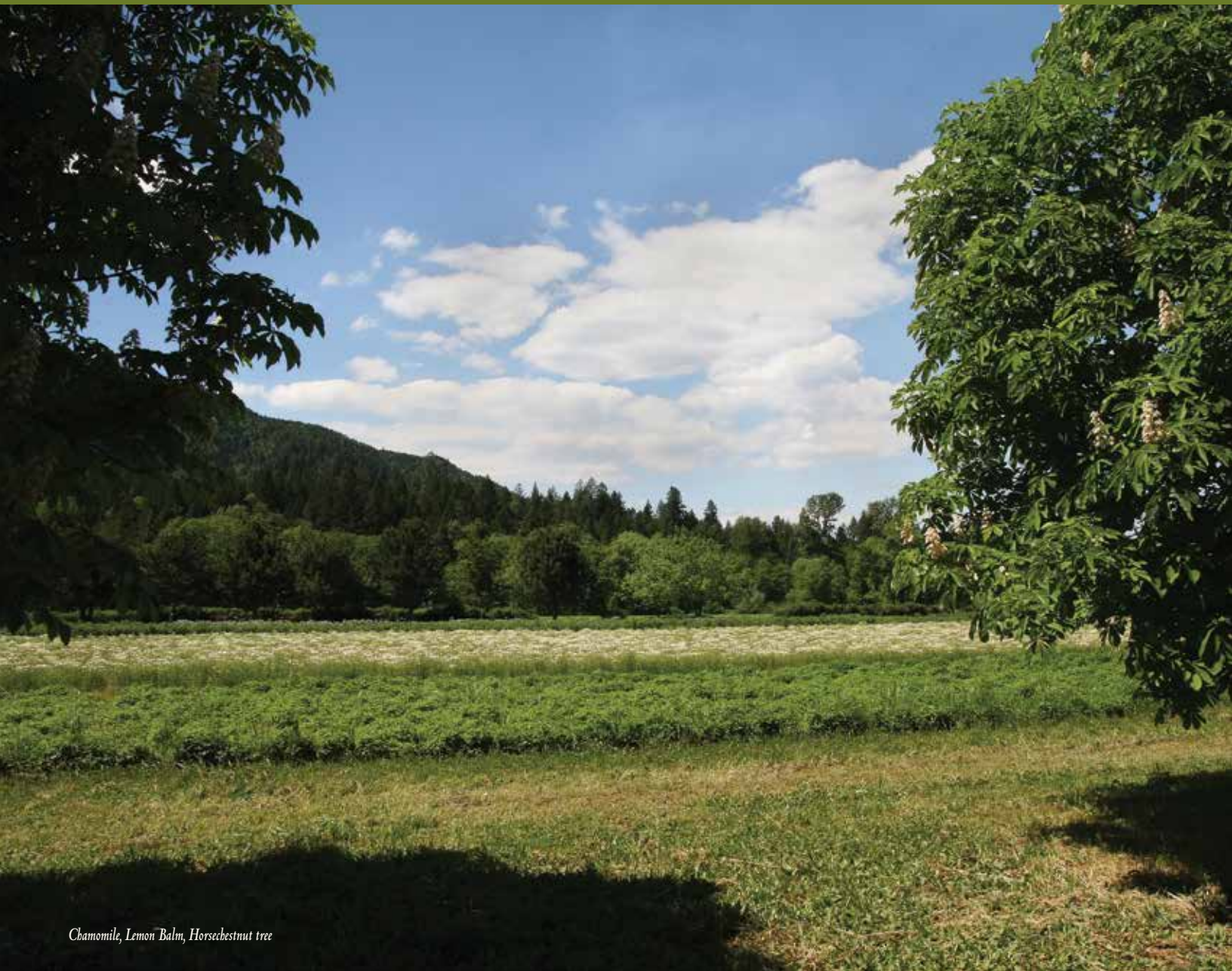
Chamomile, Lemon Balm, Horsechestnut tree

Pacific Botanicals 4840 Fish Hatchery Road, Grants Pass, Oregon 97527 • Phone: (541) 479-7777