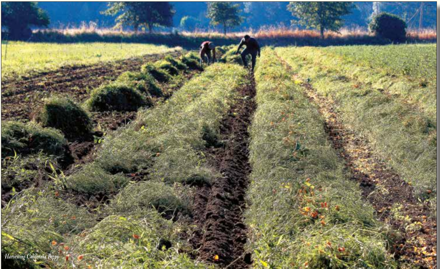
Harvesting California Poppy