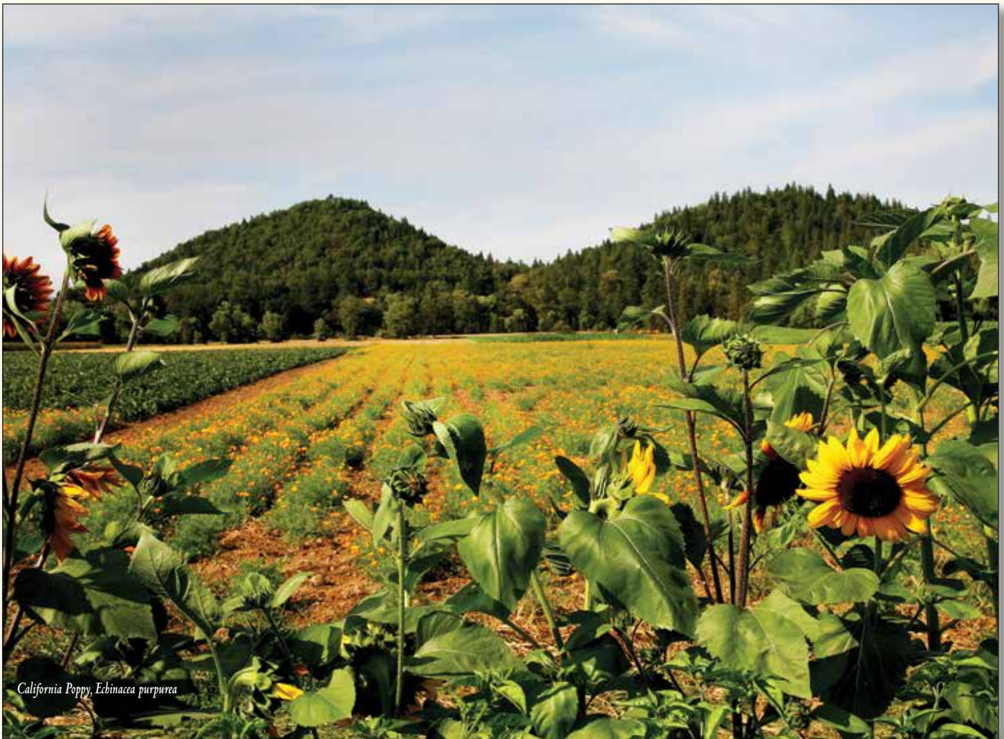
California Poppy, Echinacea purpurea

To order, see page 10 , call 541-479-7777 or go to www.pacificbotanicals.com